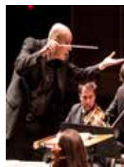
The Music of Brahms