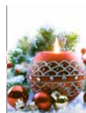
Candlelight Christmas RSO Special