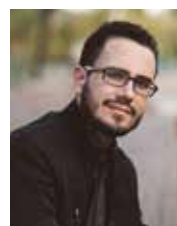
Tchaikovsky Symphony No. 4 Masterworks