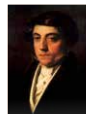
Rossini String Sonata Government House