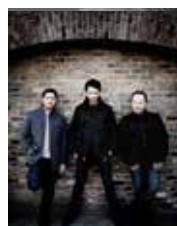
A Celtic Tenors Christmas Shumiatcher Pops