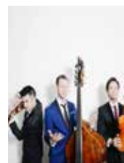
Time for Three