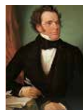
Trout Quintet Government House