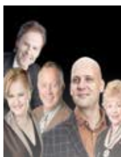
Candide: Opera in Concert