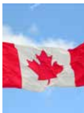
Voices of Canada