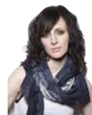
Reimagining Broadway Shumiatcher Pops