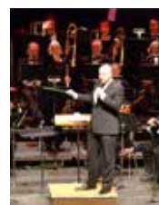
Handel's Messiah & Sing-Along RSO Special