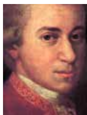
Mozart in March