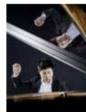
Pictures at an Exhibition