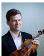
James Ehnes & Beethoven Masterworks