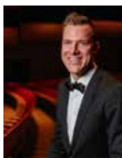
Strauss Horn Concerto