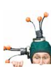
Symphony Shenanigans RSO Kids