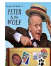
Peter and the Wolf