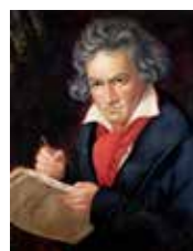
Beethoven Septet Government House