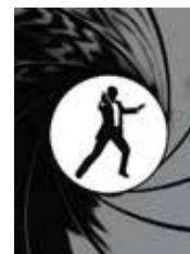
Fifty Years of Bond...