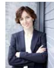
Beethoven Symphony No. 4 Masterworks