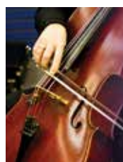
Beethoven String Quartet